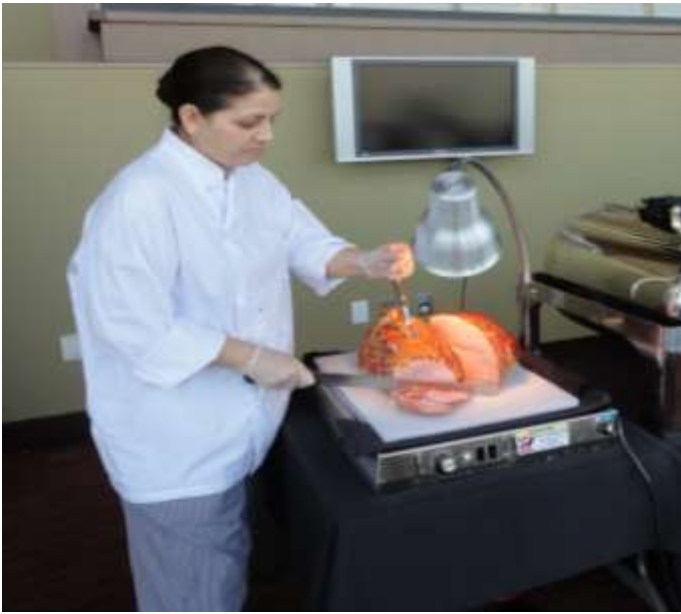
Ham to Order