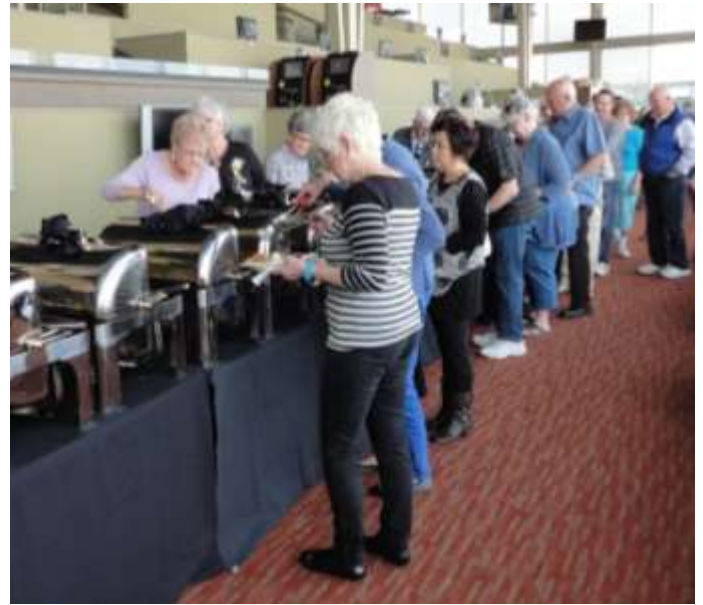
Filling our plates